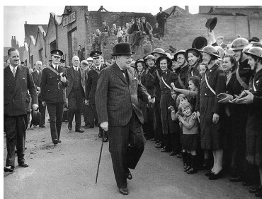
Winston Churchill Keep Calm and Carry On

A district requests that a popular history teacher create a video presentation on “resilience in crisis.” He focused on a key phrase, used by Winston Churchill during the darkest days of World War II, “Keep Calm and Carry On,” which was imprinted on a button with Churchill’s face which and worn by students and faculty. The history teacher also makes the point that in the future, people may say that regarding the way the school and community are conducting themselves, “This was their finest hour.”