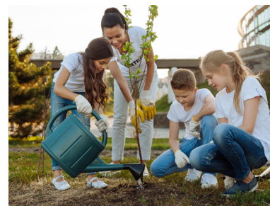
The memorial that was planted near where the soldier played as a boy.

A school learned that one of its graduates, a soldier, had lost his life in the Middle East. Students in his former elementary school decided to plant a tree in his honor and raised a small amount of money to purchase a tree. The nursery owner donated the tree. They decided to plant the tree near their school playground. The planting ceremony was made more poignant by a sensitive newspaper article beautifully capturing the emotion and meaning of the event. The story was framed and permanently placed in the school and school district board room. The reporter was viewed as a sensitive friend of the school district.